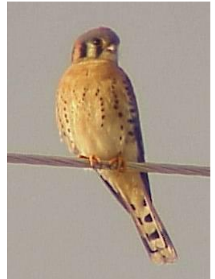
American Kestrel