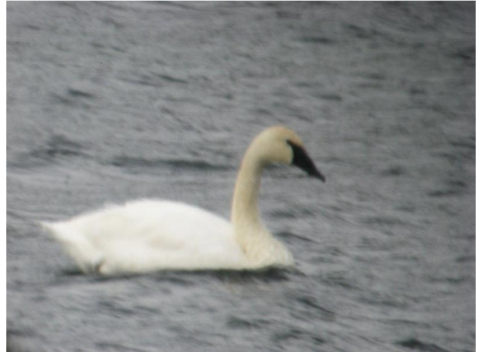
Trumpeter Swam Hayden Lake in 2008