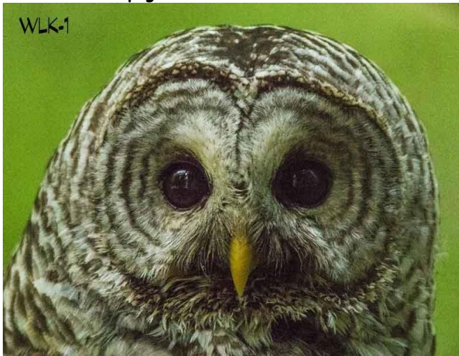
Barred Owl – June 2016 CDA River

However, spring gets busy for our Audubon Chapter. Earth Day is scheduled for April 22, and Migratory Bird Day is scheduled for May 16. Mark these days on your calendar; they are significant events for our club. We'll be scheduling more field trips including a three day trip to the George C. Reifel Park outside of Vancouver, BC. as well as other nearby sites. This trip is tentatively scheduled for the weekend of May 30.