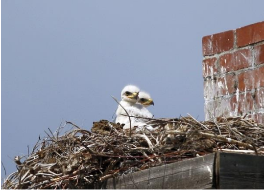
Ferruginous Hawk chicks