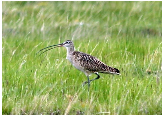
Long-billed Curlew

Wildlife Refuge was established in 1935 to provide a safe nesting area for the then-rare Trumpeter Swan. In 1932 it is estimated that there were fewer than 70 Trumpeters worldwide, at an area near Yellowstone. Now, according to the US Fish and Wildlife Services, there are about 47,000 in North America, and almost 500 in the area surrounding Red Rocks. What a marvelous success story!!! It was during this day that we discovered a pond filled with hundreds of twirling dervishes, better known as Wilsons Phalaropes. Here we took our photo with some neighborhood cows (see photo). We visited the Refuge Center, and Linda and Vera climbed the Lookout Tower while the rest of us talked with the Ranger and enjoyed the Center's exhibits.