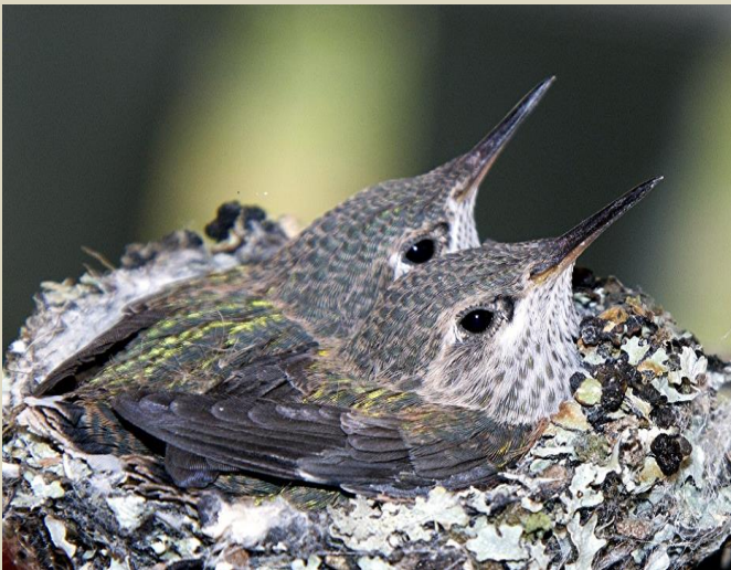
Rufous Hummingbird Young in Nest – Hoo Doo Valley 2012